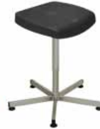
7NG 22VHXX 00 000