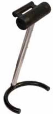
7KA 82FXYO 00 905