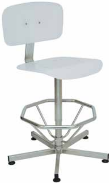
3NN 32VHXX 04 000