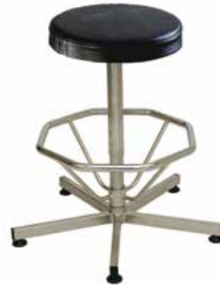
7NN 12VHXX 04 905