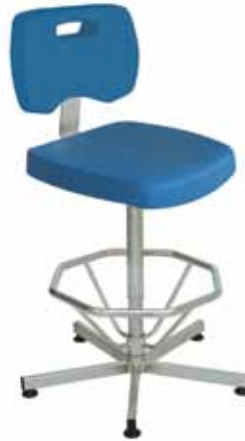
7NG 32VHXX 04 512