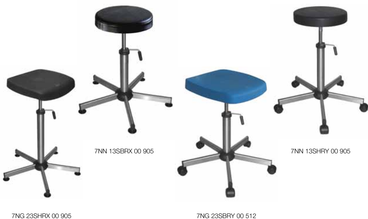
7NG 23SHRX 00 905