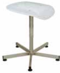
3NN 22VHXX 00 000