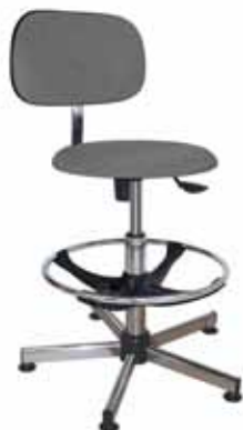
4GM 34GHLP 92 737