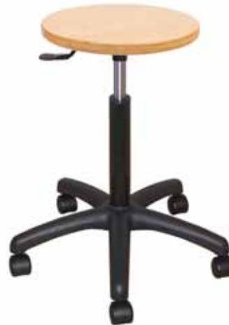
5NN 10NHNR 00 000