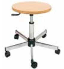
5NN 10GBJR 00 000