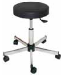
7NN 10GBJV 00 905