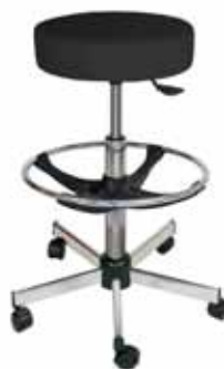
4GN 10GHJR 02 905