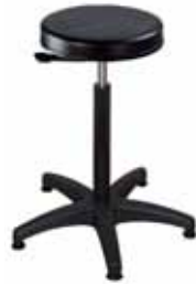
4NN 10NHNP 00 905