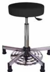
4GN 17GPJH 00 905