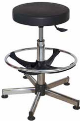
7NN 10GHJP 02 905