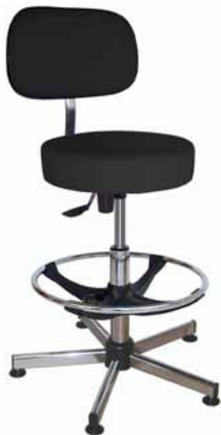
4GM 34GHLP 02 905