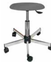
4GN 10GBJR 90 737